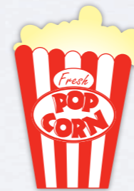
POPCORN 74mm x 52.967mm