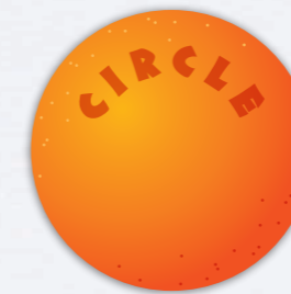
CIRCLE 74mm x 74mm