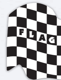
FLAG 74mm x 57.203mm