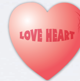
LOVE HEART 74mm x 73.236mm