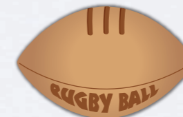
SPORTS 58mm x 74mm