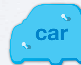
CAR 58.221mm x 74mm